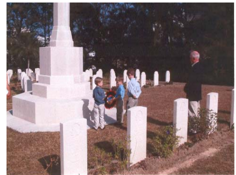
A TRIBUTE FROM THE SIGNALLERS CLUB OF CANADA